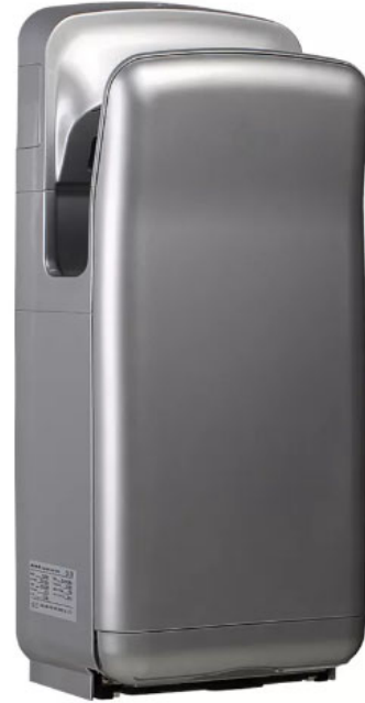
Product no.: HTAP-SL-1900 El-no.: 58 662 19 (NO) GSIN-no.: 7072395000197