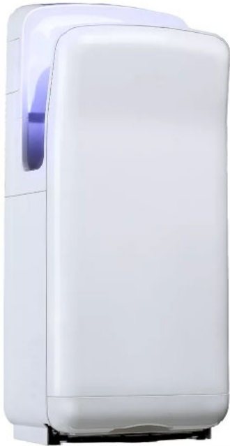
Product no.: HTAP-HV-1900 El-no.: 58 662 09 (NO) GSIN-no.: 7072395000098